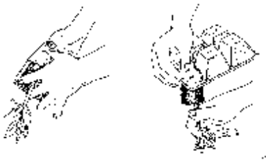
Figure 14-1: click to see larger version

Plants in cell packs or containers should be watered thoroughly and allowed to drain before removal from the container. A damp root ball is less likely to fall apart. Do not pull plants from their containers. Remove plants from individual containers by tipping the container and tapping the bottom. To remove plants from cell packs, turn the container upside down and squeeze the bottom of the container to force the root ball out of the pack. If the plants are in fiber pots, remove the paper from the outside of the root mass. When setting out plants in peat pots remove the upper edges of the pot so that the lip of the peat pot is not exposed above the soil level where it will act as a wick and pull water away from the plant.