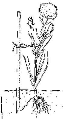
Figure 14-2: click to see larger version

Many tall annuals such as cosmos and celome may need support to protect them from strong winds and rain. Begin staking when plants are about one-third their mature size. Many materials can be used for staking: wire cages, bamboo stakes, tomato stakes, twiggy brushwood, or wire rings. The staking material should be 6 to 12 inches shorter than the height of the mature plant. Place stakes close to the plant, but take care not to damage the root system. Sink them into the ground far enough to be firm. Loosely tie plants to the stakes, using paper-covered wire, plastic, or other soft material. Tie the plant by making a double loop with one loop around the plant and the other around the stake to form a figure-eight. Never loop the tie around both the stake and plant. The plant will hang to one side and the stem may become girdled. Plants with delicate stems (like cosmos) can be supported by a framework of stakes and strings in crisscrossing patterns.